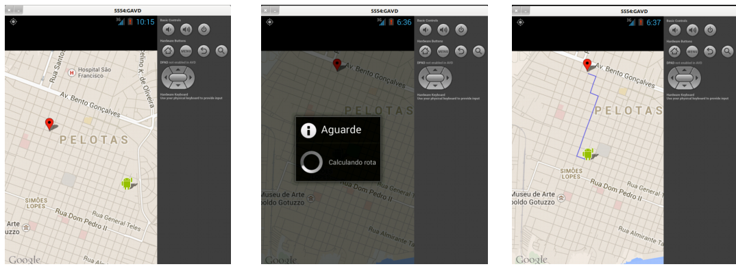
(a) Origin and destination points