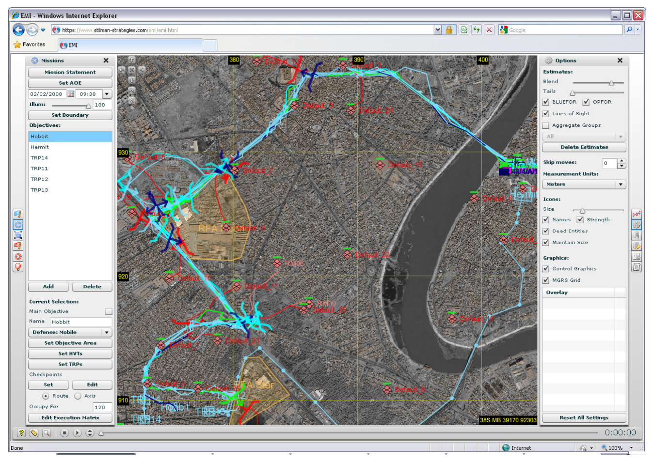
Fig. 1. GMI: Detailed COA for Blue and Red forces in complex urban terrain.

information. This permits modeling a wide range of missions and behaviors, including Search missions and Intelligence Verification missions (Section III). For instance, a UAV can be tasked to fly to all locations with intelligence pieces and verify whether there is (or is not) an actual enemy entity there employing positive or negative sensor contacts.