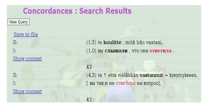
Fig. 4. Concordance.

The project also sets new challenges in developing an efficient, robust and flexible search engine for processing interpreting and subtitling corpora, i.e. electronic corpora with transcripts of discourse with consecutive and/or simultaneous interpreting or subtitles.