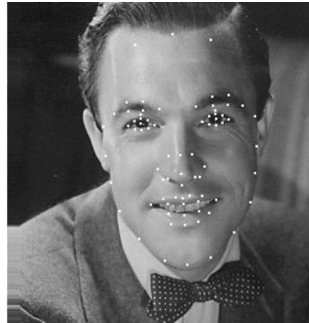
Fig 2. Detection of 76 fiducial points with STASM.

Some characteristics of the ASM application in this work are: detection in only two dimensions of digital images, a detection on frontal faces and with neutral expressions, i.e., that does not present any type of facial gesture. By default, STASM detects 76 fiducial points as shown in Fig. 2, delimiting the contour of the face, eyebrows, eyes, nose and mouth. From the above cited procedure, the vector of positions corresponding to the fiducial points is obtained.